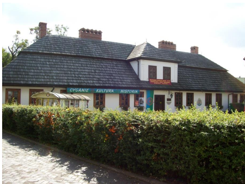
Fig. The building of Ethnographic Museum in Tarnów

In addition to educational establishments, some efforts to promote education and the integration of Roma children with Polish children are also taken by other institutions. One of the most active in southern Poland is Tarnów Ethnographic Museum, a branch of the local District Museum.